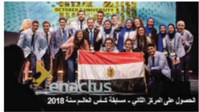
الحصول على المركز الثاني - مسابقة كأس العالم سنة 2018