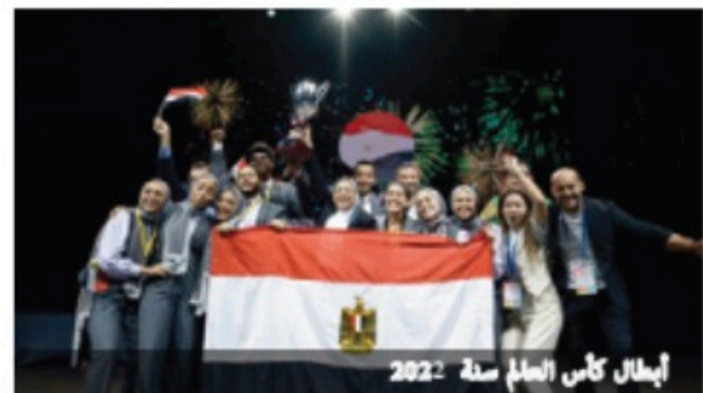
أبطال كأس العالم سنة 2022