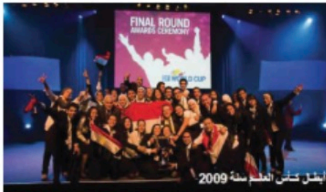
أبطال كأس العالم سنة 2009