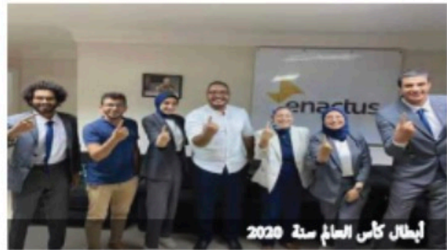
أبطال كأس العالم سنة 2020