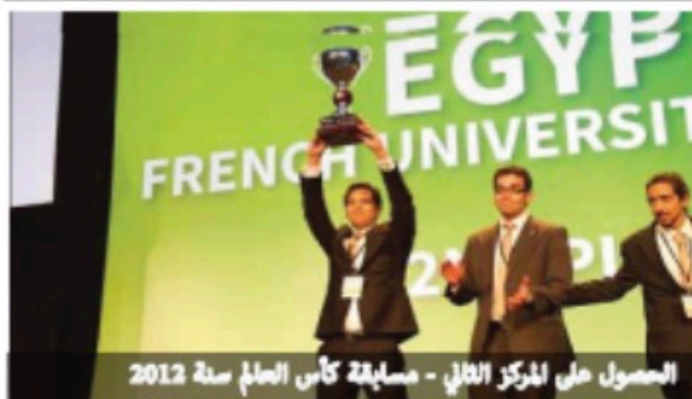
الحصول على المركز الثاني - مسابقة كأس العالم سنة 2012