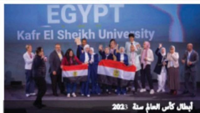
أبطال كأس العالم سنة 2023