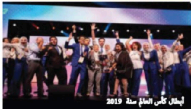
أبطال كأس العالم سنة 2019