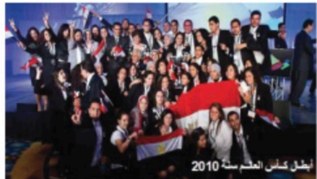
أبطال كأس العالم سنة 2010