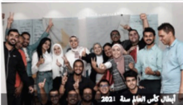
أبطال كأس العالم سنة 2021